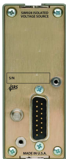
SIM928 rear panel